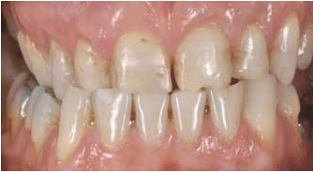
Fig 9 The vertical preparation applied in a full-mouth rehabilitation.