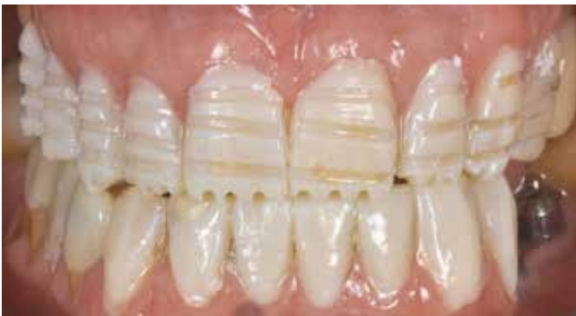
Fig 11 Calibrated preparation could be performed in the same clinical session.