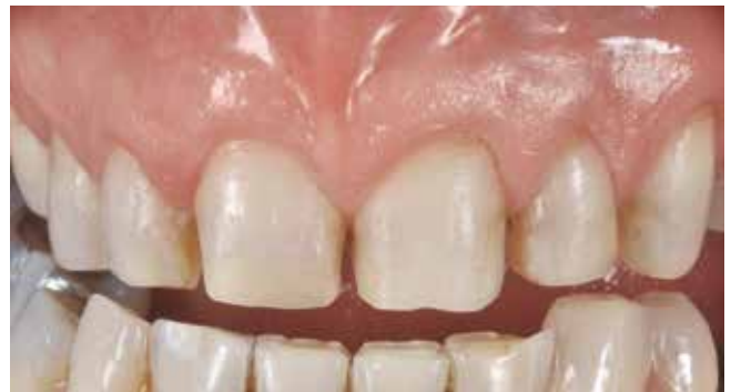
Fig 12 The final vertical preparation.

The manufacturer gave the authors a positive opinion on the use of the investigated finish line in the case of veneer restorations.