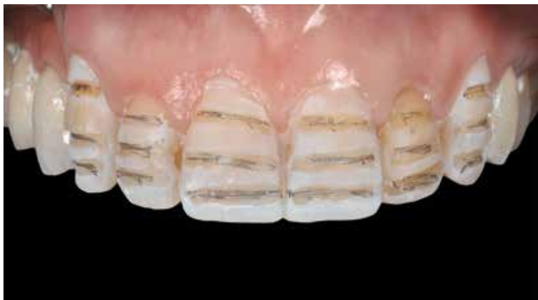
Fig 6 Preparation through the simulation of the final restoration is a key element of this procedure.