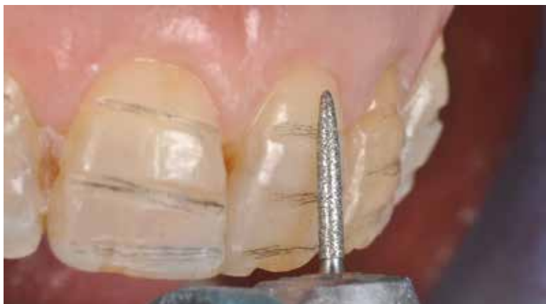
Fig 7 The vertical preparation aims to maximize tissue preservation.