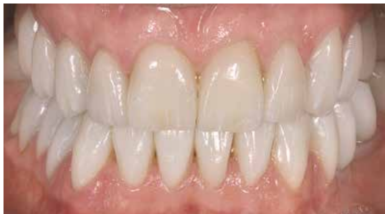
Fig 14 The ceramic restorations 48 h after luting.

was refined where needed, and any adjusted crown surfaces were polished. Final occlusal adjustments were performed with egg-shaped burs (grit size 125 \mu\text{m} ). The ceramic surface was then polished with silicone discs (Ceramic polisher 9545 F; Braseler) and felt wheels using polishing paste (Dia Glace diamond paste; Yeti) (Fig 14).