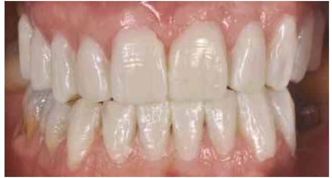
Fig 10 The final volume of the ceramic restorations is shaped to achieve an increase in the vertical dimension of occlusion when it is needed.