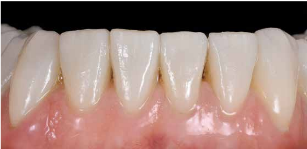
Fig 16 Follow-up.