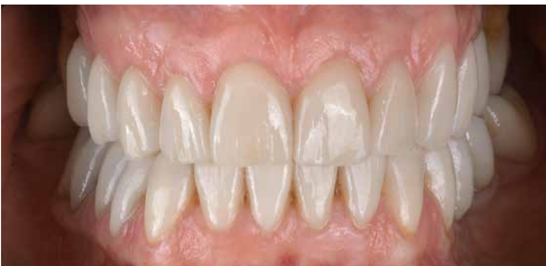
Fig 17 3.5-year follow-up.