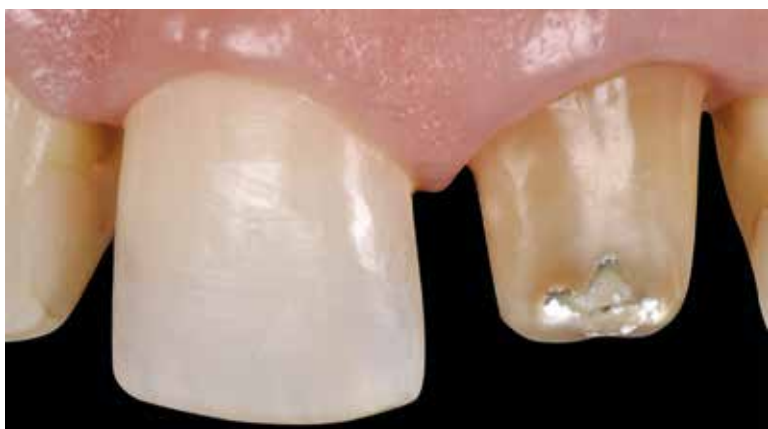
Fig 8 The same finish margin could be used in combined veneer and crown restorations.

pressed veneers with knife-edge margins placed in a private dental practice environment.