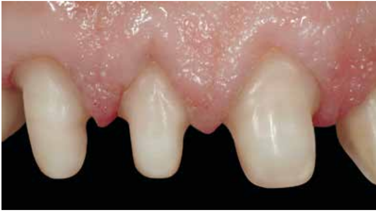
Fig 1 Horizontal preparation.