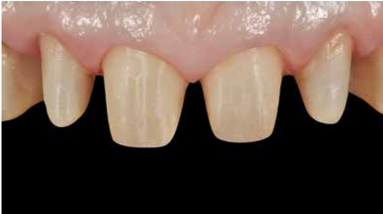
Fig 2 Vertical preparation.