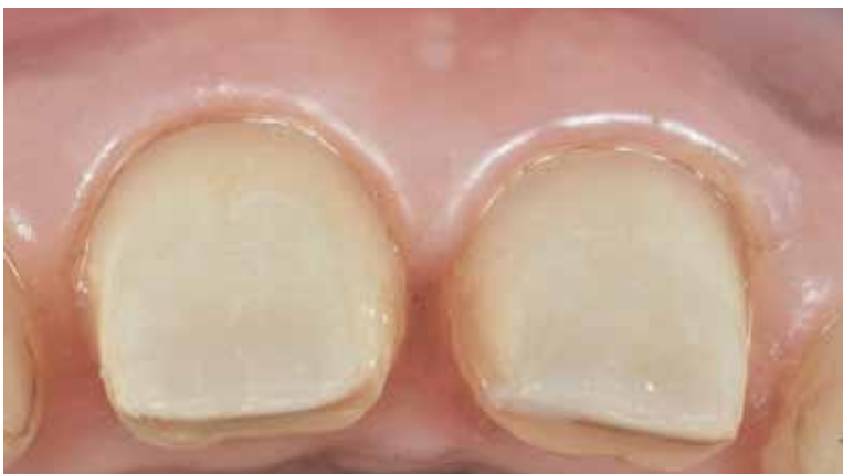
Fig 3 Occlusal view of a vertical preparation.