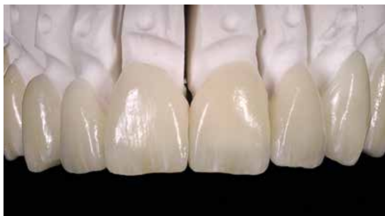
Fig 13 The pressed LiDiSi ceramic veneer on the master cast.