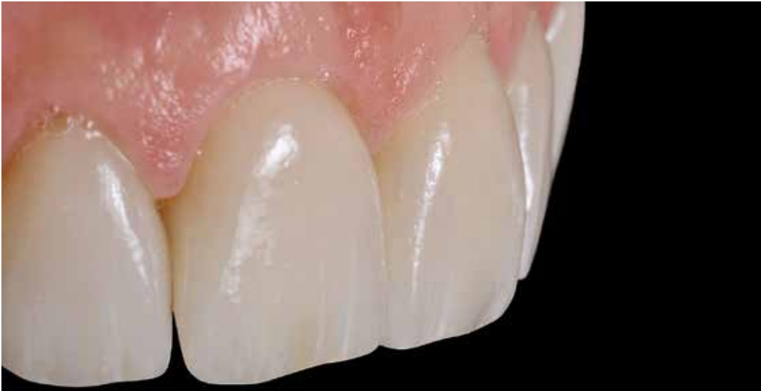
Fig 15 Follow-up.